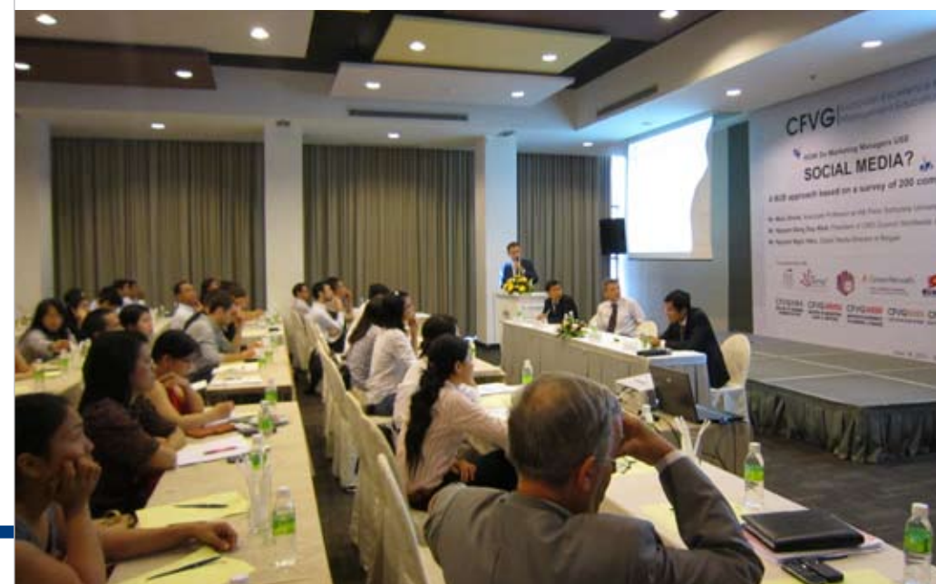
Workshop on Social Media