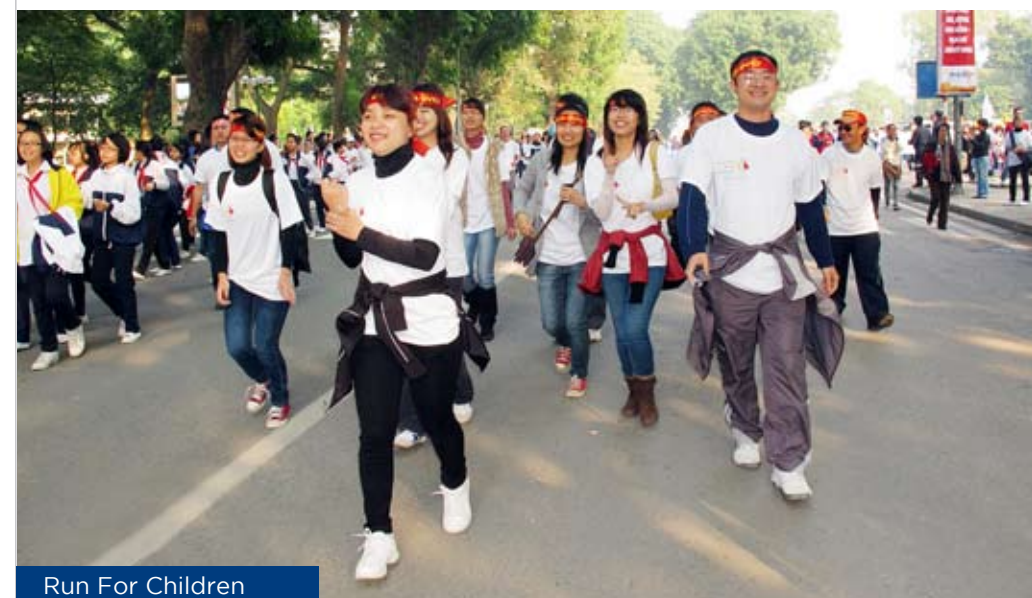
Run For Children

For more information about the CFVG alumni network, visit: www.cfvgalumni.org